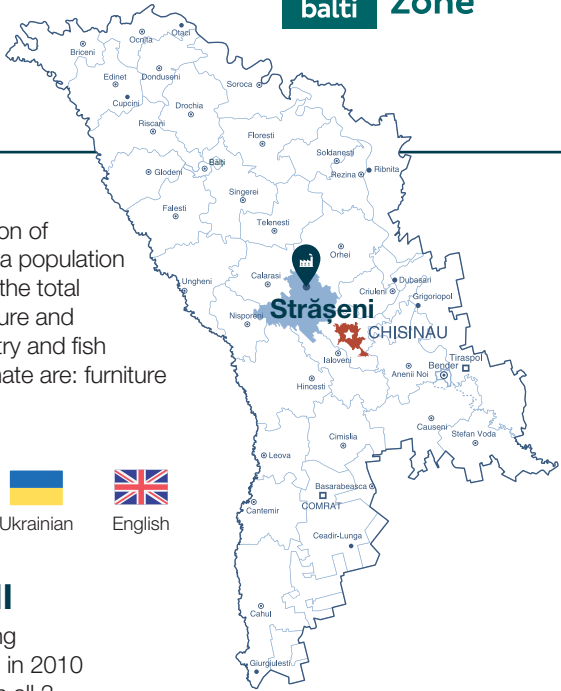
FEZ STRĂȘENI Subzone Strășeni

Subzone Strășeni comprises four delimited areas of three brownfield and a greenfield located in the industrial zone of Strășeni Municipality. The Brownfields represent production and administrative buildings of the former plants. The total available area of the production premises within subzones is 55,000 sqm. The Brownfields are connected to utilities such as natural gas and electricity, having water and sewerage connection points in close proximity. The most important resident of subzone Strășeni is electric cable producer – La Triveneta Cavi Development. The Greenfield subzone is located in 600 m distance to the European route E58 and in immediate proximity to railway route Chisinau – Iași (ROU). The land plot area of 15 hectares is in private ownership and available for rent or sale.